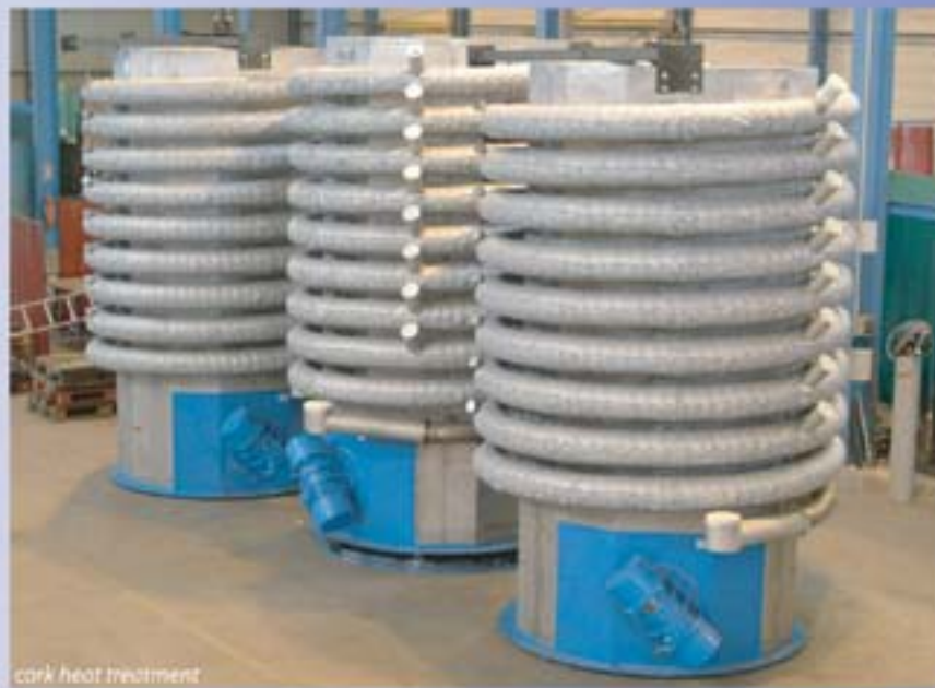
cork heat treatment