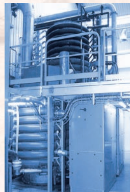
McCORMICK: 1300kg/h of black pepper