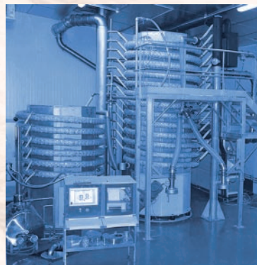
ARKOPHARMA: 400kg/h of medicinal plants