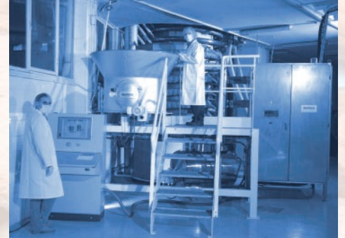
LIRA industrial units: 500 kg/h of spices and herbs

The drying and cooling section of the REVTECH system allows rapid and efficient stabilization when compared to competing technologies. Final moisture content is easily adjusted to the required level. Dry air is used at atmospheric pressure, eliminating variations due to climatic conditions, while the amount of drying required is significantly lower due to the small amounts of steam used for sterilization.